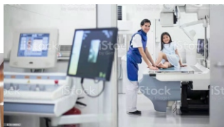
X Ray room