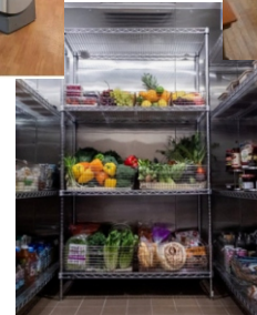
Food processing plant