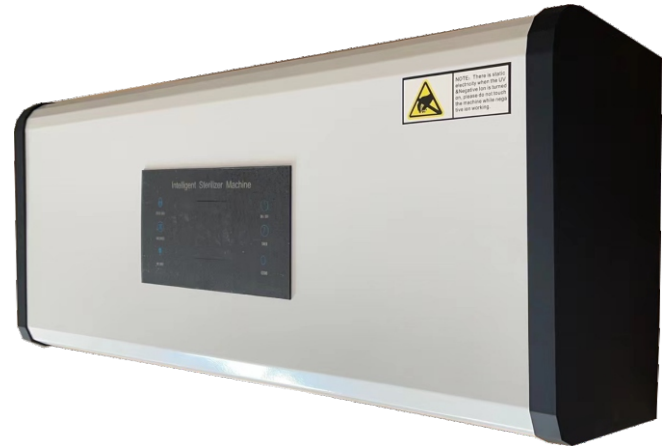
UVGI AIR STERILIZER

Product dimension: 165x250x600mm Net weight: 7.6kgs Packing information: 1 pc/inner carton: 660x280x320mm